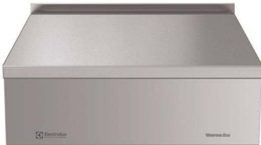
589165 (MCNABBH000) Closed Work Top, one-side operated with backsplash